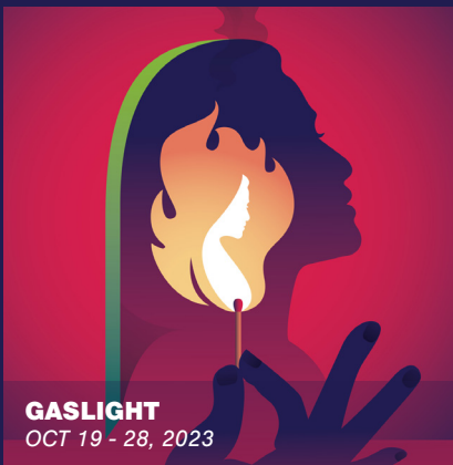
GASLIGHT OCT 19 - 28, 2023