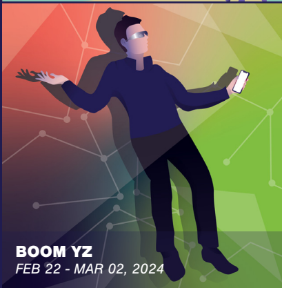
BOOM YZ FEB 22 - MAR 02, 2024