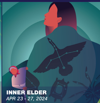
INNER ELDER APR 23 - 27, 2024