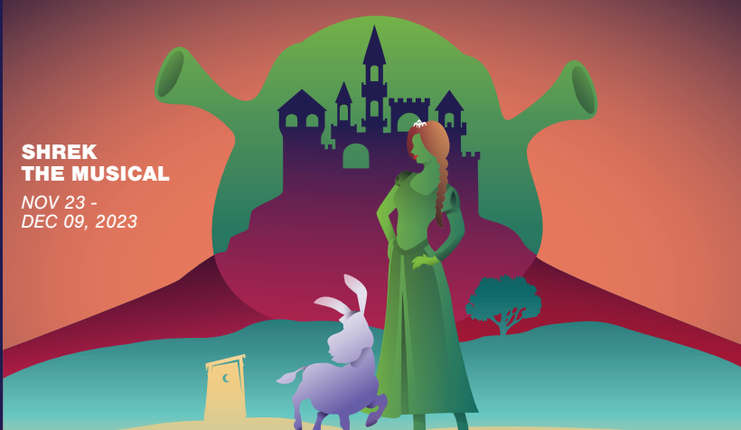
SHREK THE MUSICAL NOV 23 - DEC 09, 2023