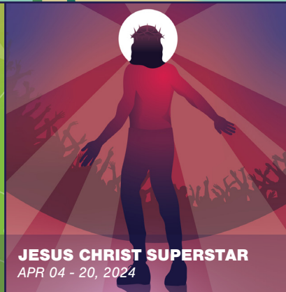
JESUS CHRIST SUPERSTAR APR 04 - 20, 2024