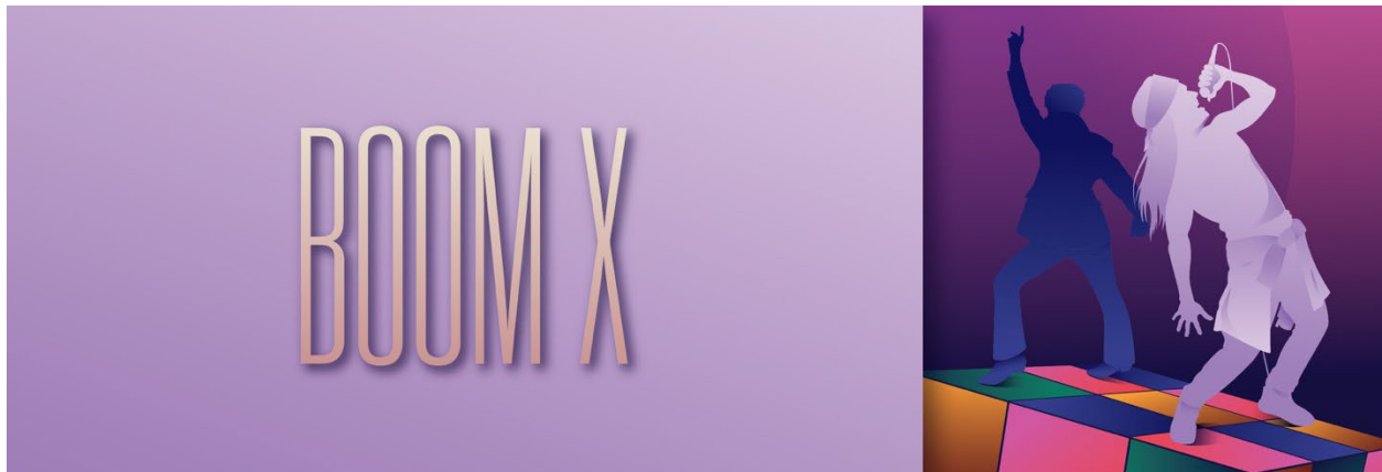
Image Description: On the left, the background is a light lavender with the words 'BOOM X' in a cream colour. On the right, there are two silhouettes, one is a person dancing in disco (his silhouette is dark blue) and the other is a Rockstar with long hair singing into a microphone (his is light lavender). They are both standing on a Rubik's cube.